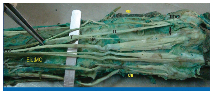
[Table/Fig-4]: Showing extensor indicis et medii communis muscle (EletMC). (EDC: Extensor Digitorum Communis, T: Tendon of Eletmc, TL: Larger Lateral tendinous slip of EletMC, TM: Smaller medial tendinous slip of EletMC, EDCI: Tendon of EDC forming the extenso expansion of the index finger, Arrow: Indicates the insertion of TM on the distal half of the dorsal surface of the third metacarpal bone, RB: Radial border, UB: Ulnar border)

Smaller Medial (TM) and Larger Lateral (TL), which travelled distally deep to the extensor retinaculum through the fourth extensor compartment along with the tendons of EDC. TL joined the ulnar aspect of the tendon of the EDC forming the Extensor Expansion for the Index Finger (EDCI). TM got inserted onto the distal half of the dorsal aspect of the shaft of third metacarpal [Table/Fig-4]. It was also observed that the bellies of these anomalous muscles were innervated by branches of the posterior interosseous nerve in the distal third of the forearm.