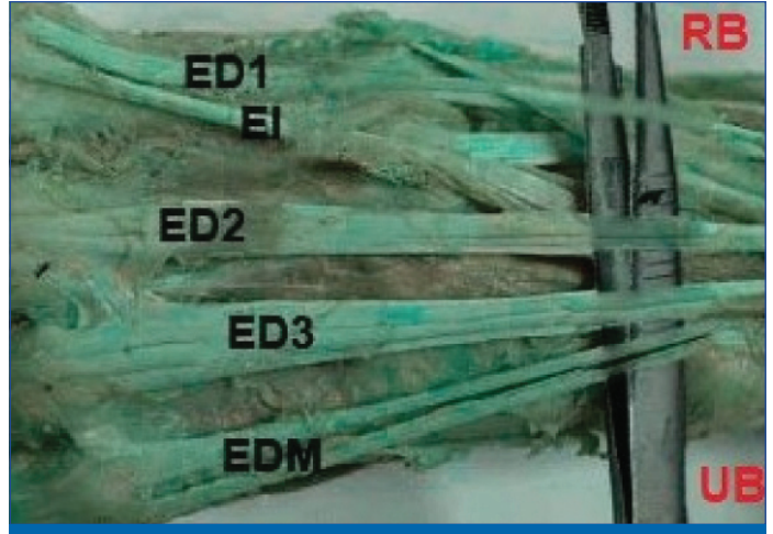
[Table/Fig-3]: Showing insertion of extensor indicis proprius into the ulnar aspect of the tendon of extensor digitorum to the index finger. (ED1, 2, 3: Tendons of extensor digitorum to index, middle and little finger, El: Extensor Indicis Proprius Muscle, EDM: Extensor Digiti Minimi, RB: Radial Border, UB: ulnar border).

Smaller Medial (TM) and Larger Lateral (TL), which travelled distally deep to the extensor retinaculum through the fourth extensor compartment along with the tendons of EDC. TL joined the ulnar aspect of the tendon of the EDC forming the Extensor Expansion for the Index Finger (EDCI). TM got inserted onto the distal half of the dorsal aspect of the shaft of third metacarpal [Table/Fig-4]. It was also observed that the bellies of these anomalous muscles were innervated by branches of the posterior interosseous nerve in the distal third of the forearm.